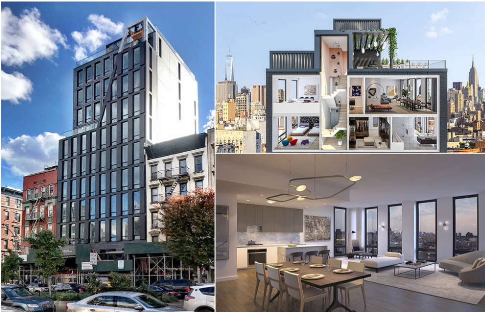
287 East Houston Street (Renderings via AA Studio)

By CityRealty Staff Monday, November 5, 2018