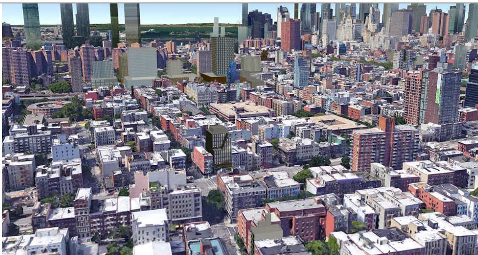
Google Earth aerial showing location of 287 East Houston Street

Finishing construction near the corner of East Houston and Clinton streets is the street's most palatable new development yet. Dubbed 287/LES (for its address at 287 East Houston), the 11-floor condo was developed by Vinci Partners and Hogg Holdings who purchased a former movie theater-building at the site for $15.2 million in November of 2014.