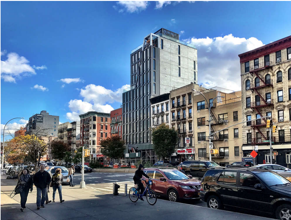
287/LES in early November 2018