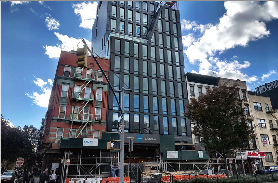
From the corner of Clinton and East Houston